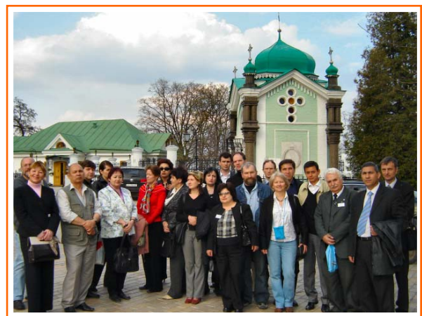
Participants in the ECNC / EECCA workshop on a visit to Pecherska Lavra monastery in Kiev