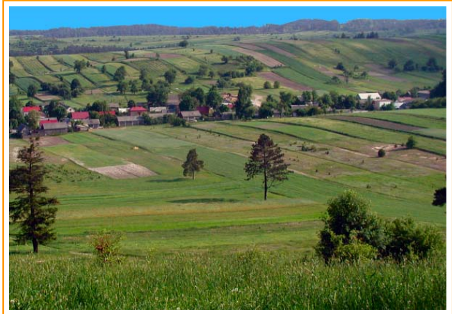
The Rostocze Hills National Park in Poland

environmental information is available and how to obtain it. Fieldfare is providing advice on biodiversity aspects of the data base.