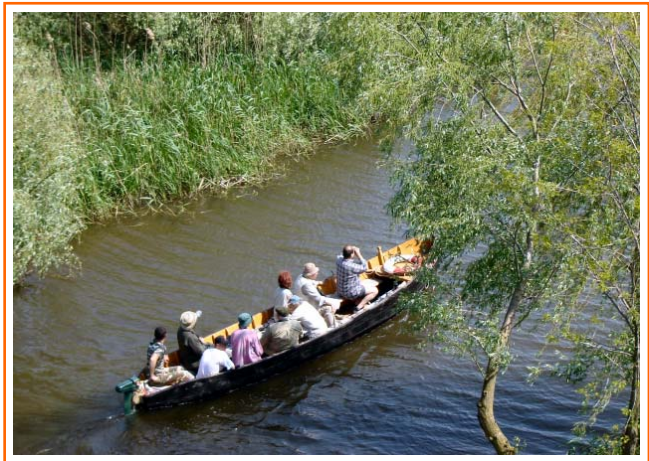
Birding in the Danube Delta, aboard the electric-powered skiff, Salvinia, built by Salix

For Salix, the party was the largest single group hosted so far and posed a major logistical challenge. The company purchased and fitted out a second minibus (a Mercedes Sprinter), and used this in tandem with the existing smaller minibus to provide flexibility and excellent service for the guests. While they were enjoying