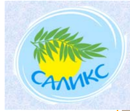
New Salix logo

The highlight was receiving an award from the Odessa Tourism Association for having the best local tour routes – a nice reward for all the effort put in by the staff over the past year.